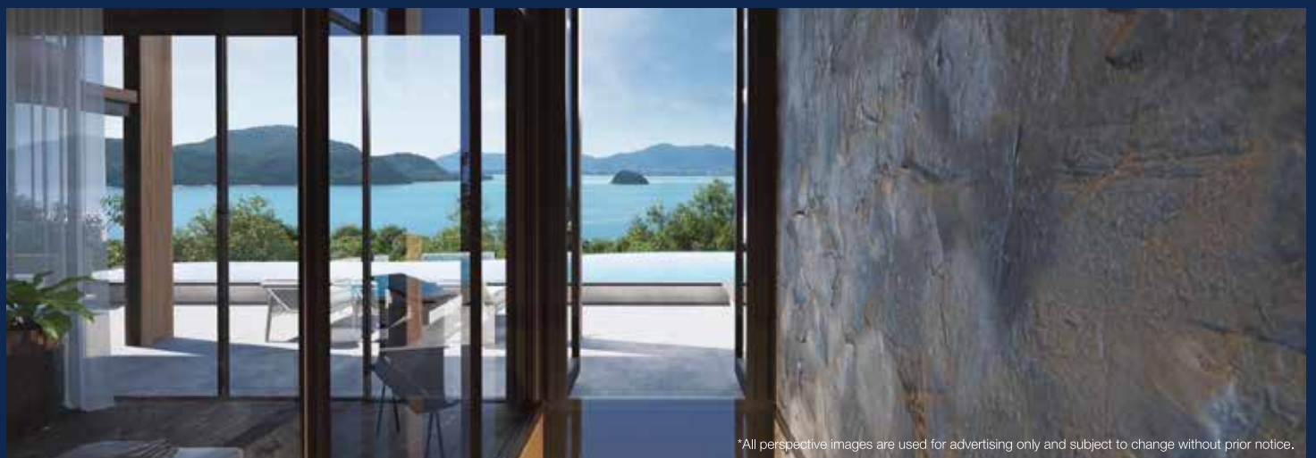
*All perspective images are used for advertising only and subject to change without prior notice.