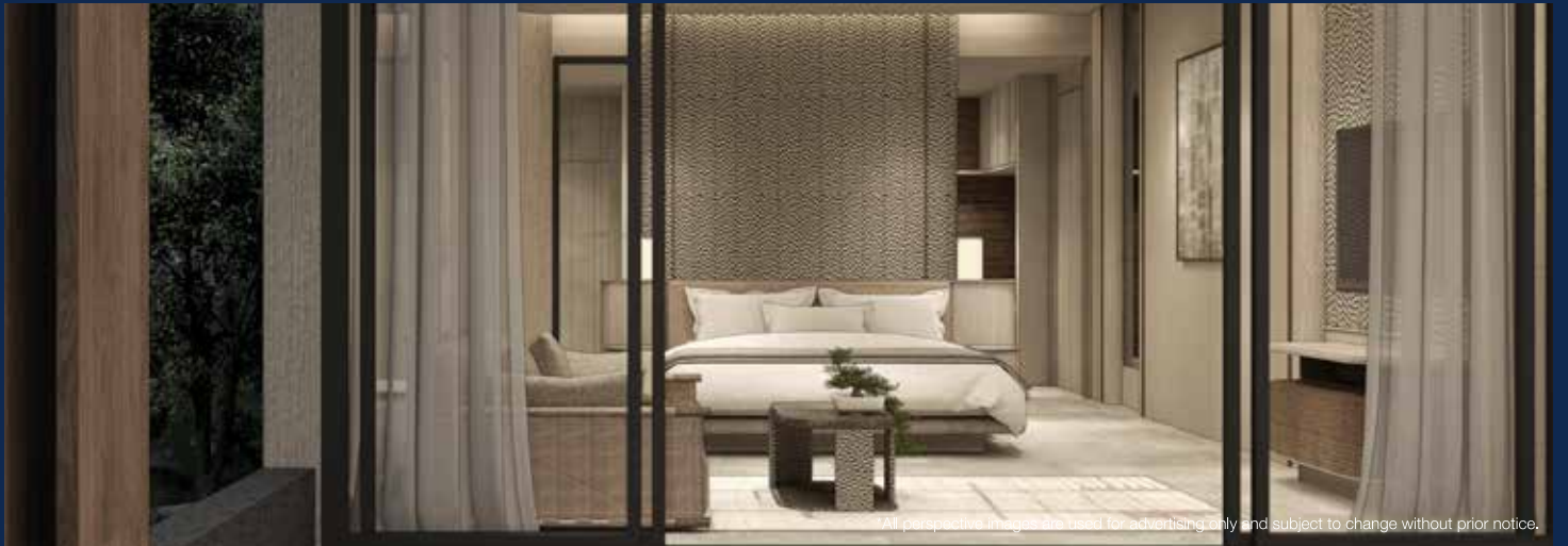
*All perspective images are used for advertising only and subject to change without prior notice.