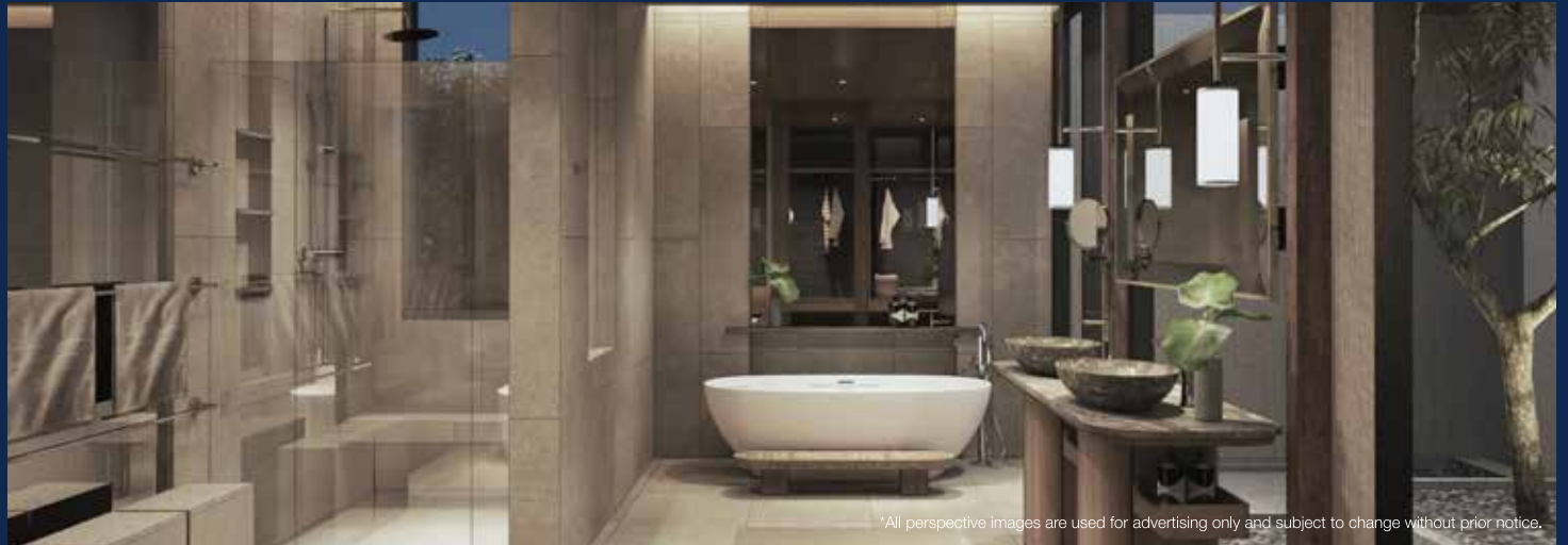
*All perspective images are used for advertising only and subject to change without prior notice.