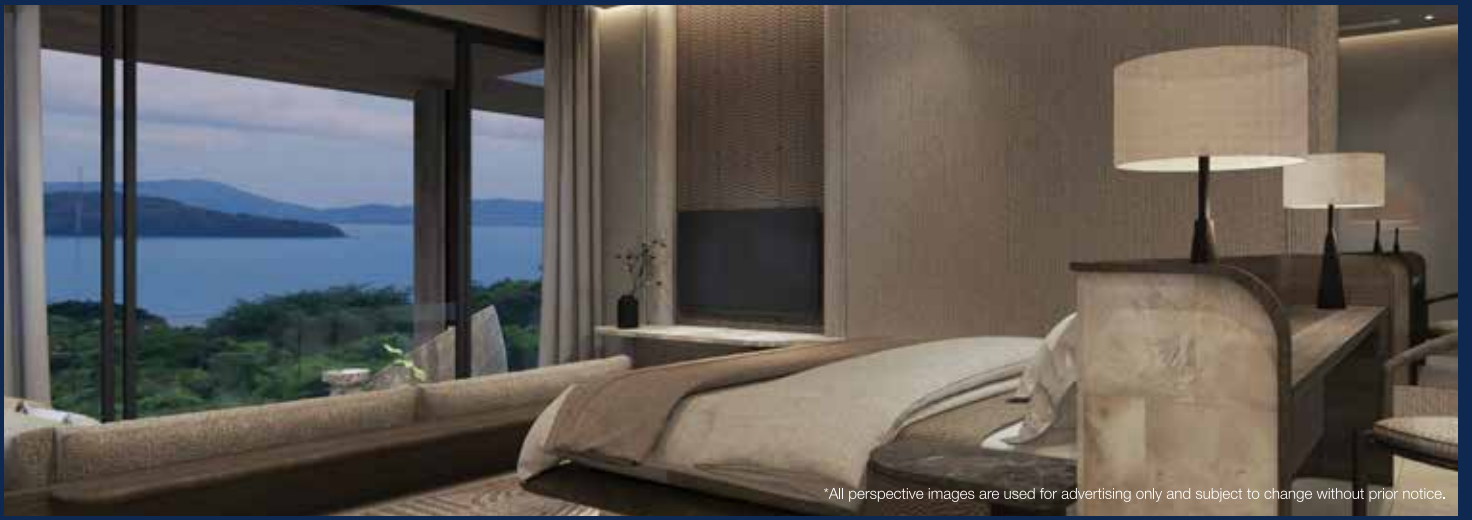
*All perspective images are used for advertising only and subject to change without prior notice.